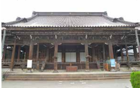
【Honganji-temple Kanazawa betsuin】 Kanazawa city