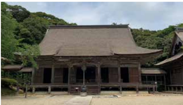
【Myojoji-temple】 Hakui city