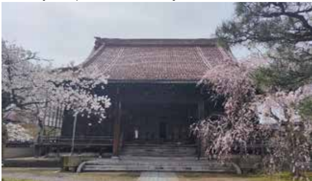
【Zuisenji-temple】 Kanazawa city