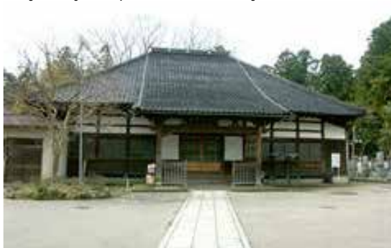
【Myohouji-temple】 Kanazawa city